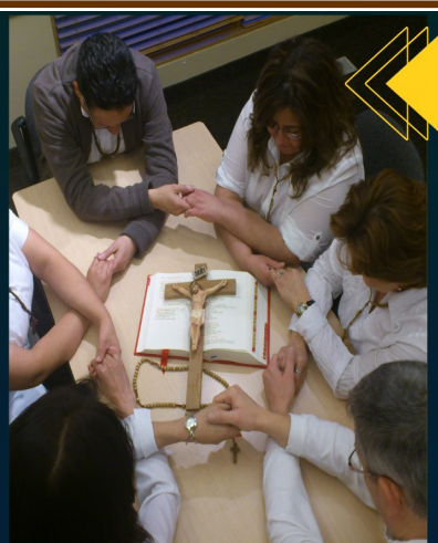
Sociedad de Misioneros del Amor de Dios Parroquia Mary, Mother of the Redeemer

email: info@misioneroslaicos.org Tel: (403) 800-6108