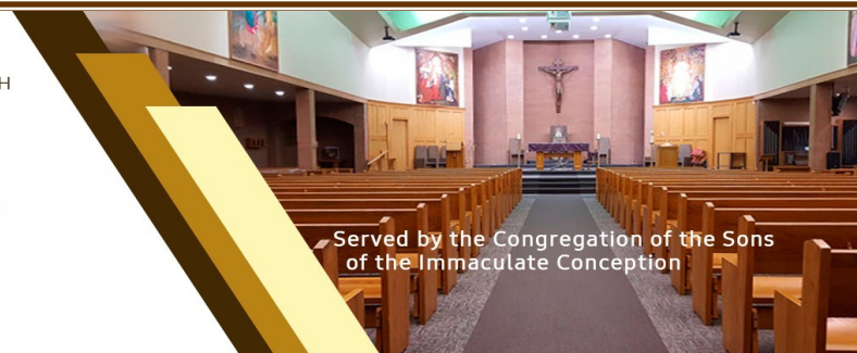
Served by the Congregation of the Sons of the Immaculate Conception